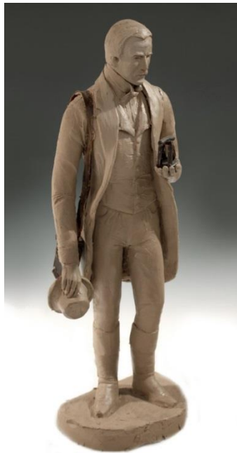
Augustus Chapman Allen