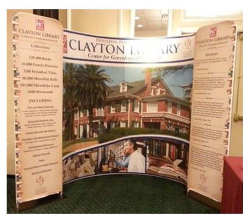
The Clayton Advocate . May 2016 - page 8 -

Clayton Library Friends has purchased a display that will be used at conferences and national meetings to introduce and promote Clayton Library. The picture below was taken at the Texas State Genealogical Society annual conference last fall. Although a full-size floor display, it slips over frames that dis-assemble easily to pack into easily transportable units. This fall we plan to use the display at the Federation of Genealogical Societies (FGS) annual national meeting being held in Springfield, Illinois August 31 thru September 3. CLF has reserved an Exhibit Hall space to promote Clayton Library to the national audience. If you plan to attend this meeting we would love to have you volunteer at the booth to help tell people about Clayton Library.