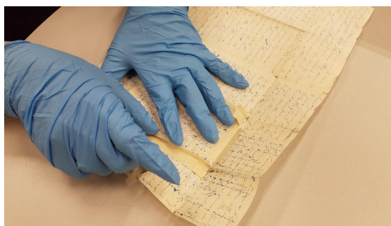
Encapsulating the fragile letter was made easier in Clayton's new collaboration areas.